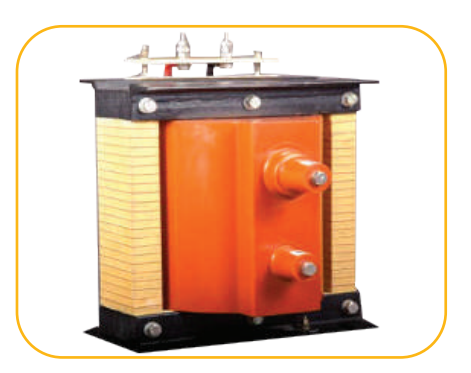
Neutral Grounding Transformers