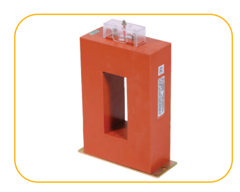
Core Balancing Current Transformer