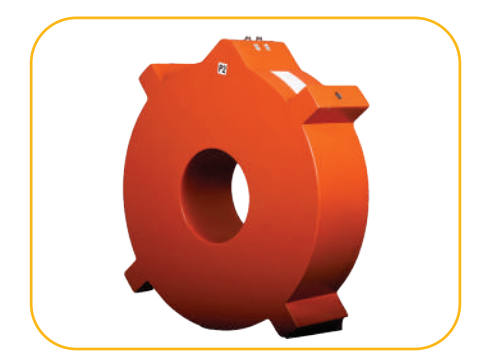
Bus Duct Current Transformer