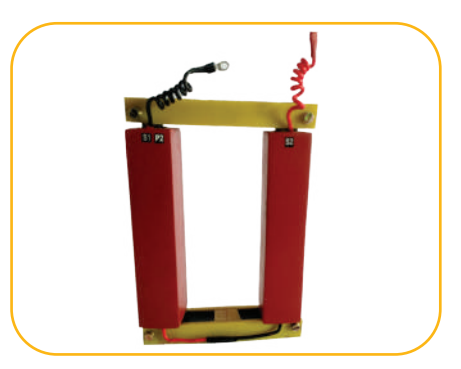
Split Core Current Transformer